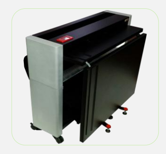
Tiltable large table